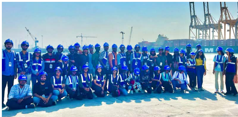
– Industrial Visit to Adani Port