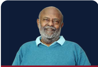
MR. SHIV NADAR

Founder – HCL Chairperson Emeritus & Strategic Advisor – HCL Tech Founder & Chairman – Shiv Nadar Foundation