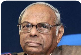
PROF. C. RANGARAJAN

Chairman – Madras School of Economics Chancellor – University of Hyderabad Ex-Governor – RBI Former President – Indian Statistical Inst.