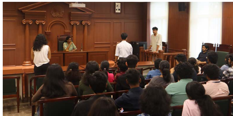
– Moot Court Session at the School of Law