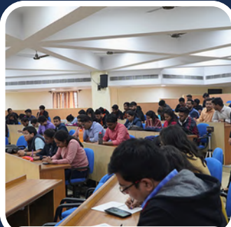
Amphitheatre style classrooms