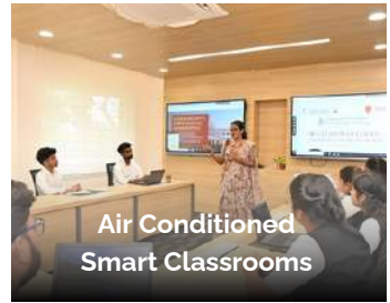
Air Conditioned Smart Classrooms