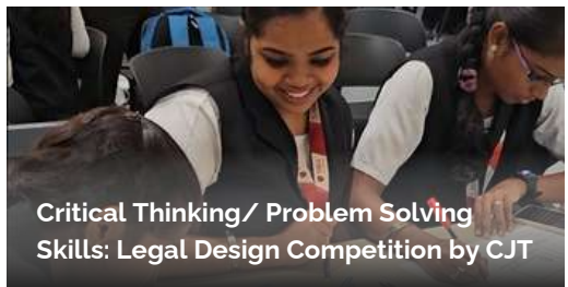
Critical Thinking/ Problem Solving Skills: Legal Design Competition by CJT