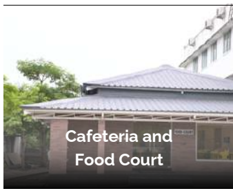
Cafeteria and Food Court