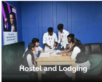
Hostel and Lodging