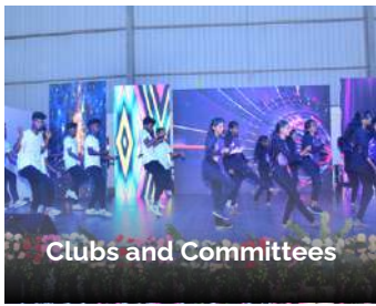
Clubs and Committees