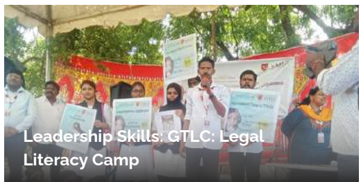
Leadership Skills: GTLC: Legal Literacy Camp