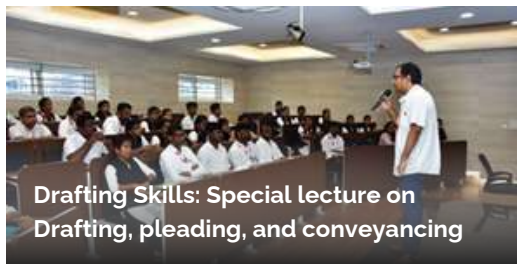
Drafting Skills: Special lecture on Drafting, pleading, and conveyancing