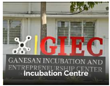
GIEC GANESAN INCUBATION AND ENTREPRENEURSHIP CENTER Incubation Centre