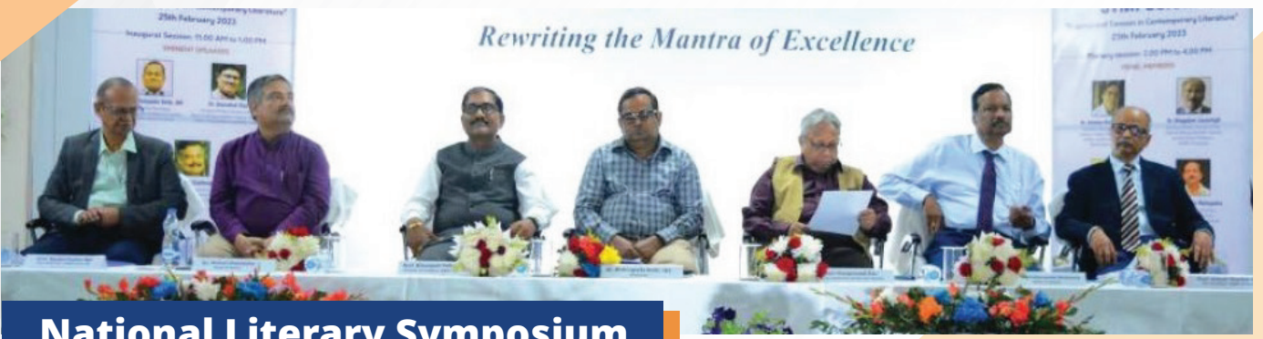
National Literary Symposium