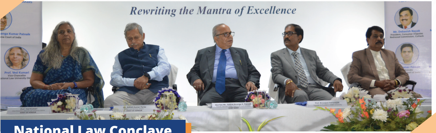
National Law Conclave