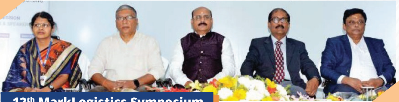
12 th MarkLogistics Symposium