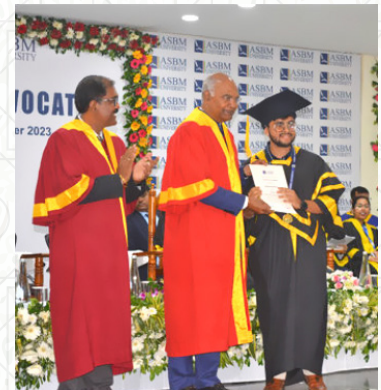
Students Receiving Gold Medals for their achievements from the Chief Guest HE Shri Ram Nath Kovind, Hon'ble President of India at Third Convocation ceremony of ASBM University