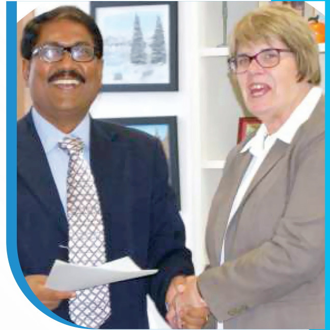
Team ASBMU with Team UNM in UNM Campus, Malaysia