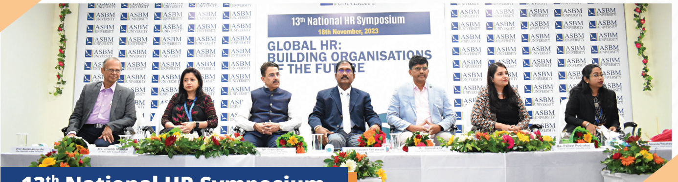
13 th National HR Symposium