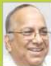
Justice Ananga Kumar Pattnaik Former Hon'ble Judge, Supreme Court of India Chairperson