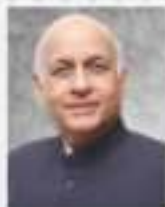
Ambassador Lalit Mansingh Former Foreign Secretary Govt. of India