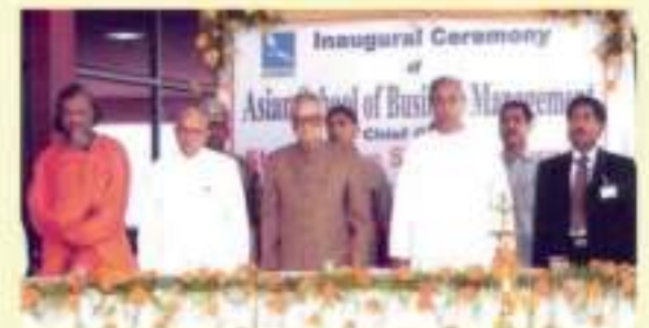
Inauguration of ASBM Campus by H.E. Shri Bhairon Singh Sekhawat, Hon'ble Vice President of India on 14.10.2006 in the presence of H.E. Shri Rameswar Thakur, Hon'ble Governor and Shri Naveen Patnaik, Hon'ble Chief Minister of Odisha.