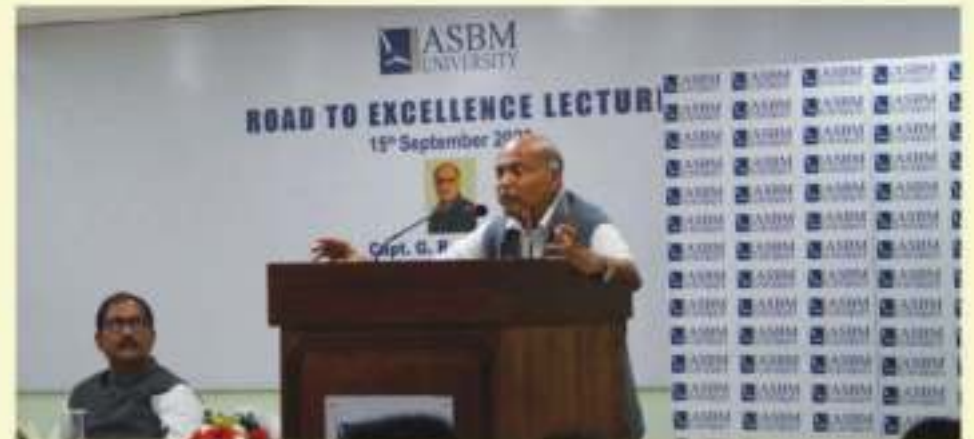
Capt. G. R. Gopinath, Founder Air Deccan addressed the students of ASBM University under Road to Excellence Lecture Series