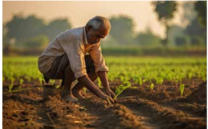
Rural Immersion Segment (RIS): 15 Days preliminary exposure to rural life & realities partnering with grassroots NGOs