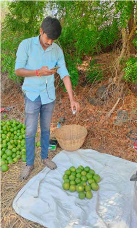
Live Project (LP-1)