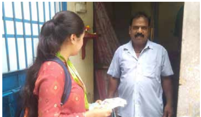
Live Project (LP-2)

Live Projects 1 & 2: Two 15 days' field sessions at predefined and identified specific industry-related projects for scientific understanding through both secondary and primary information