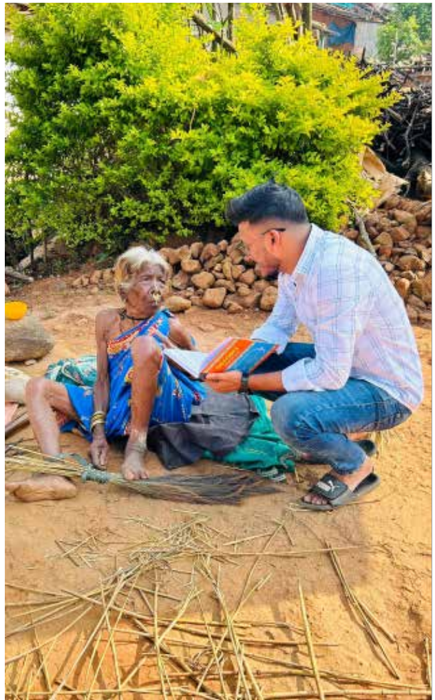
Management Traineeship Segment (MTS) - II 60 Days of Field Exposure to Holistic Managerial Orientation