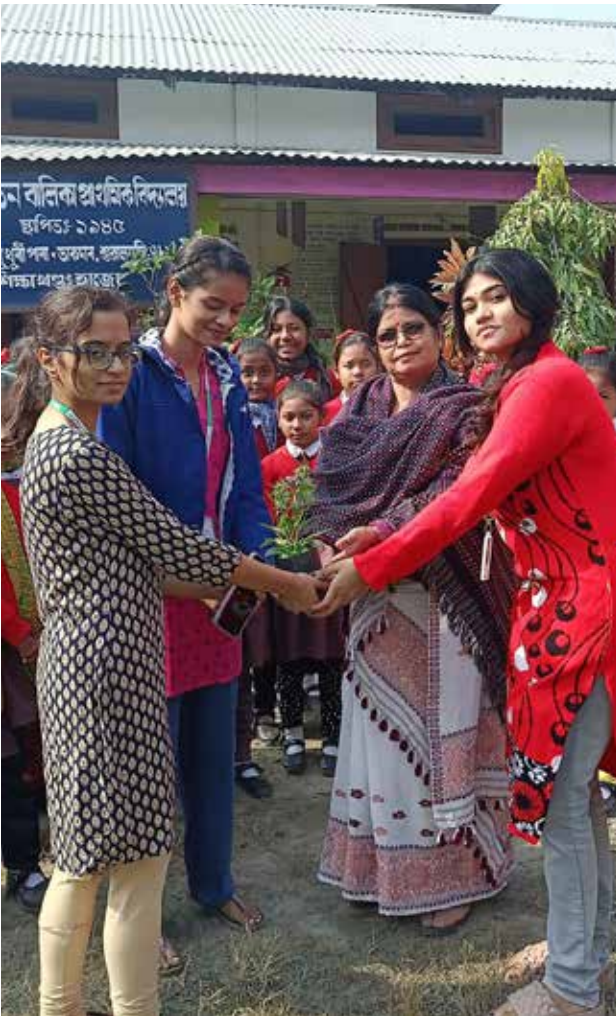
Management Traineeship Segment (MTS) - I 50 Days of Field Exposure to Focused Case writing