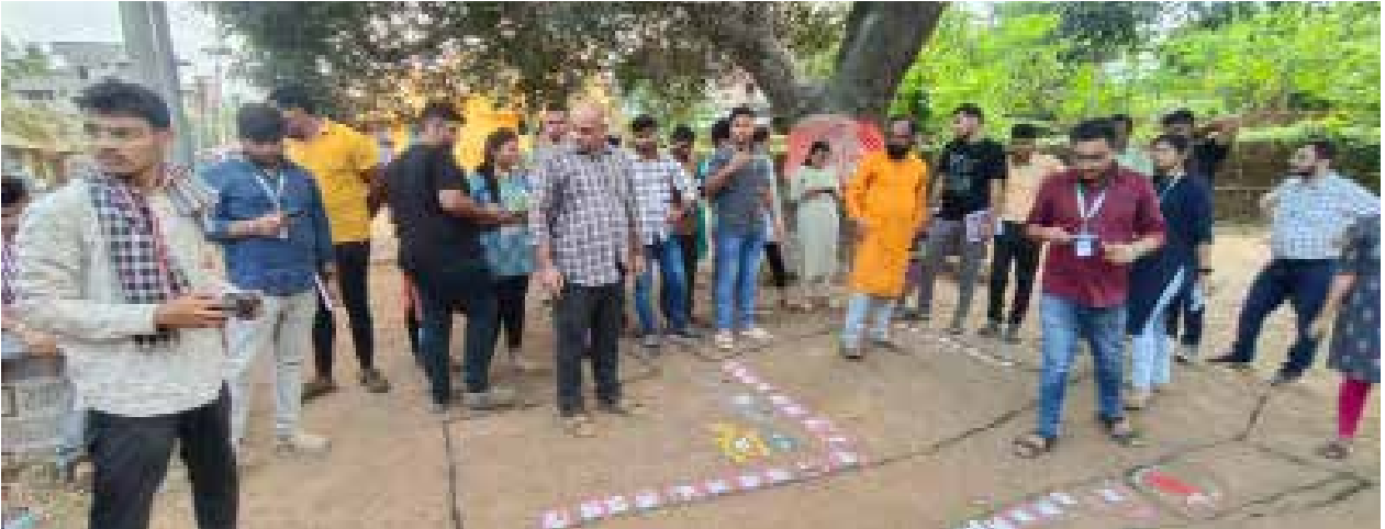
Village Study Segment (VSS) - 40 Days of Field Exposure to Village Studies